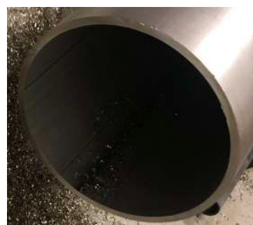
Pipe stainless steel 115 x 5 mm